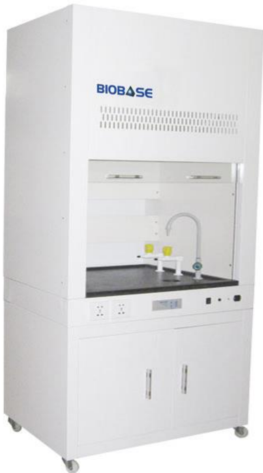
FH1200 Fume Hood