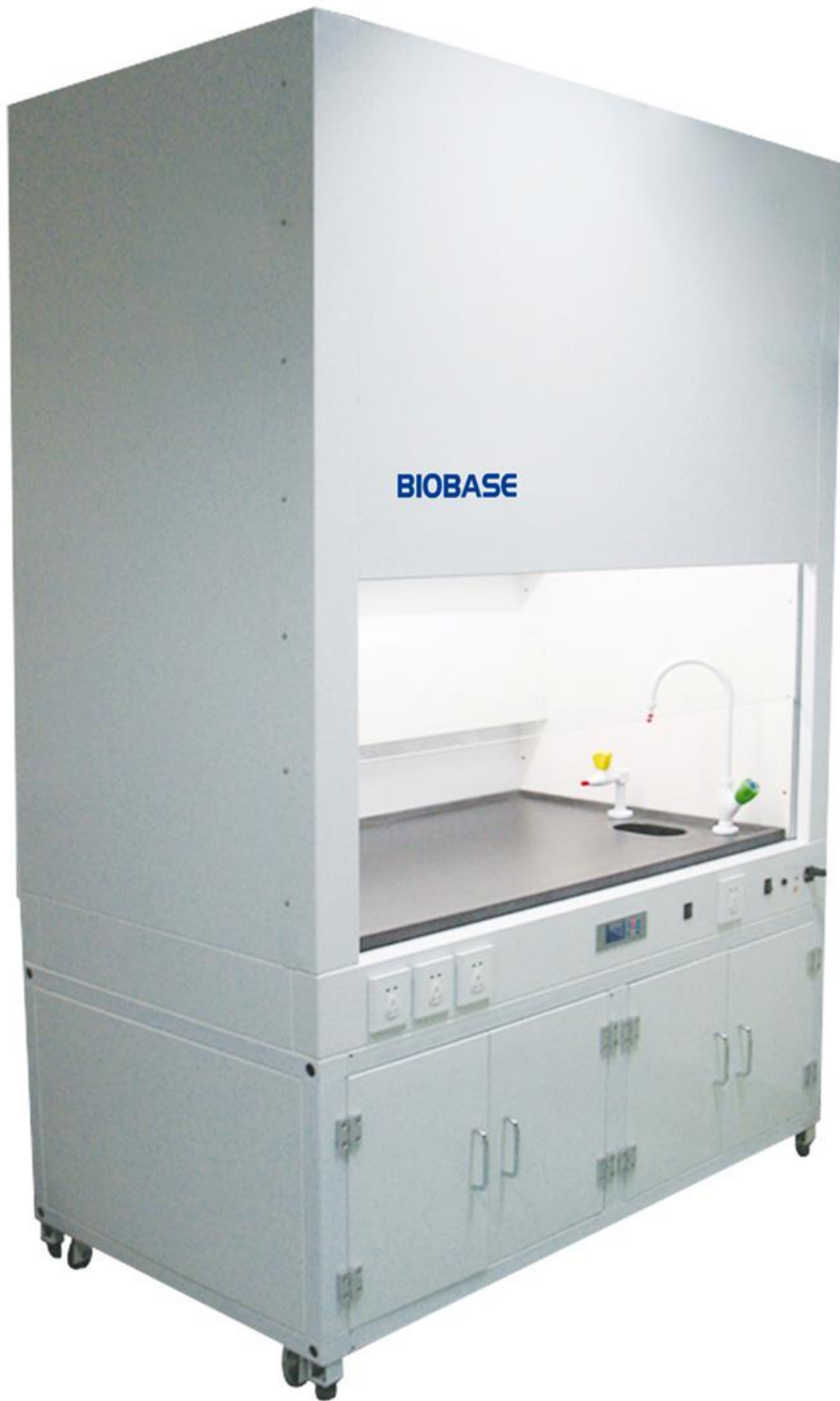
FH1500 Fume Hood